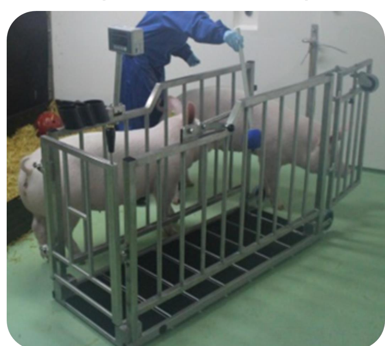
[R - Pig guided further into the crate, rewarded and then the gate at the back is closed]

This training approach has been successfully implemented in order to make pigs move into a weigh crate. The process is shown below: