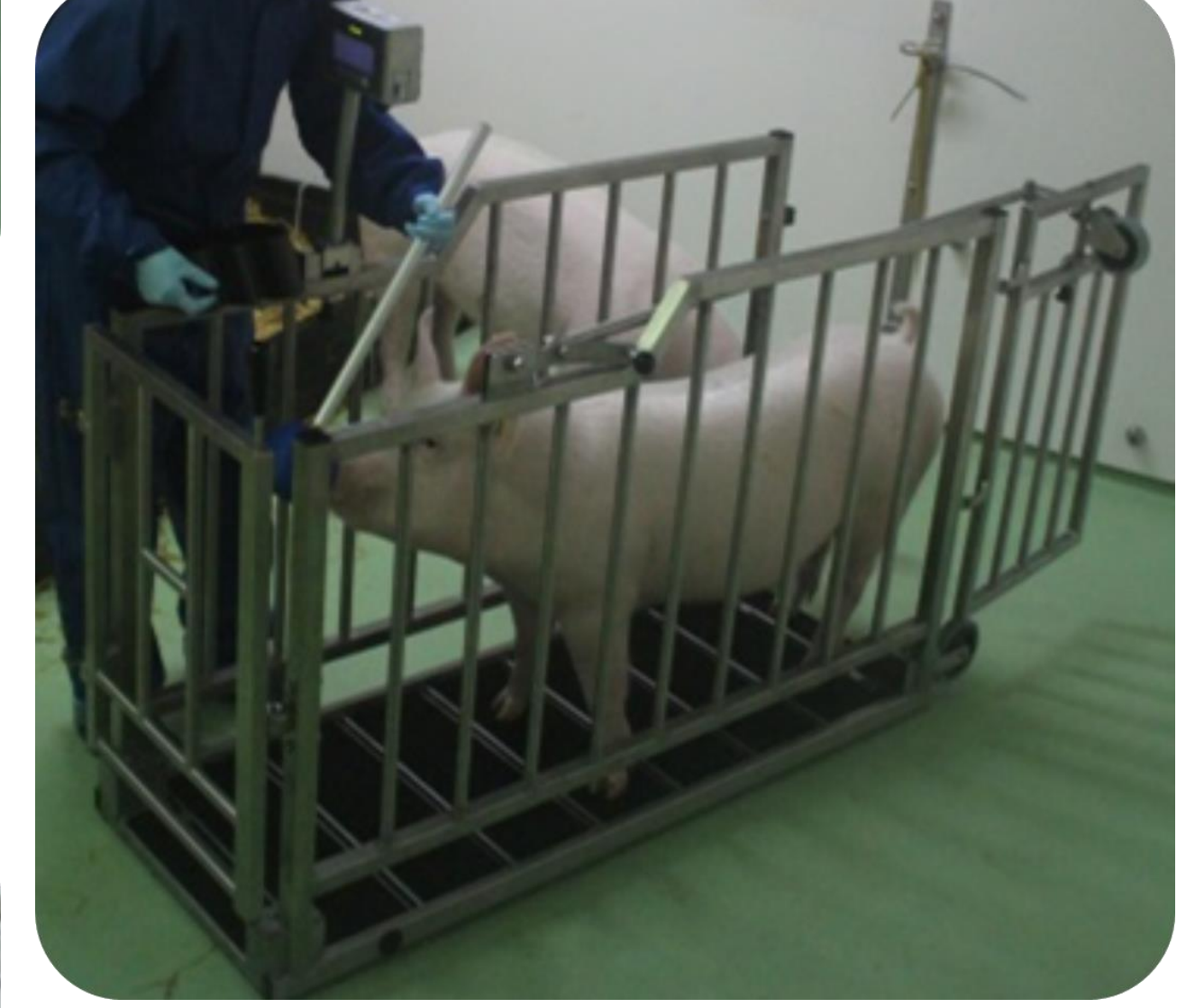
[L – Once weighed the pig can be guided out and rewarded once more. Once the pigs get used to this they can be rewarded less]