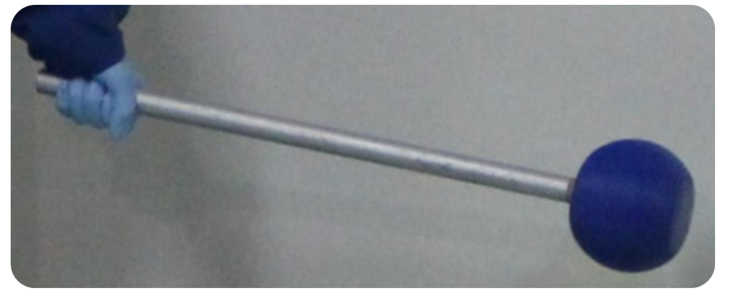
[Target stick used]

increasing desired behaviours with a reward (usually food) after they have been performed. The reward needs to be a food they are keen on and something they don't get other than for training. For this I used grapes.